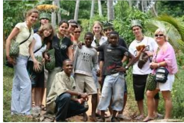
Spice Village - Zanzibar