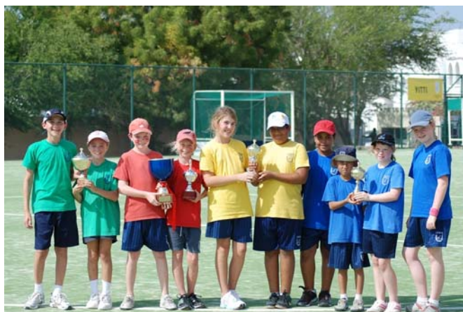
House captains proudly show off their trophies

Overall winners – RUWI, 2 nd Ghubrah, 3 rd Yitti and 4 th Bowsher