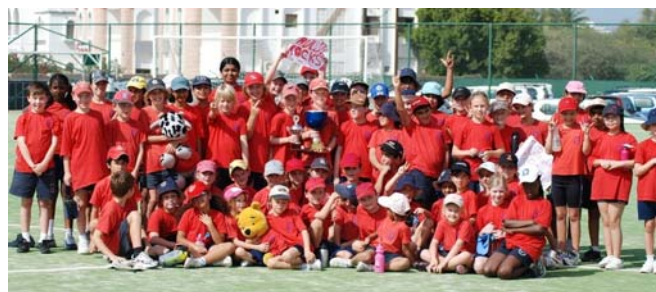
The winning team 'Ruwi' with mascot and trophy

Health & Safety: Mobile Phones & Driving – It has been brought to my attention that some drivers have been using their mobile phones whilst driving in our car parks. This is dangerous and could lead to a serious accident involving a child or adult. Therefore, all drivers are strongly urged not to use their mobile phone whilst driving or maneuvering in any of our car parks. Thank you in anticipation for your understanding and co-operation.